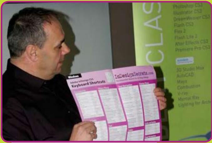
One of the most useful bits of paper in the studio! An ID shortcuts poster provided by InDesign Secrets is displayed at the welcoming address and later won by one lucky member.